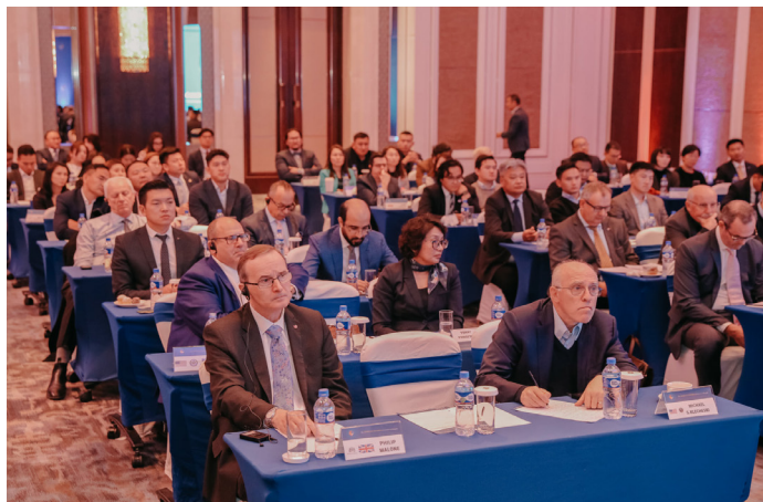
Chief of Cabinet Secretariat of Government of Mongolia Oyun-Erdene L.