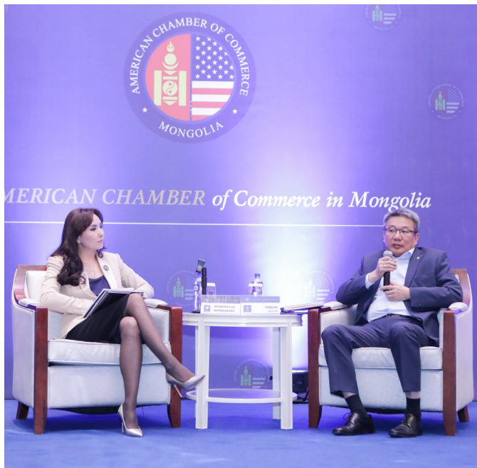
Minister of Mining and Heavy Industry Yondon G.